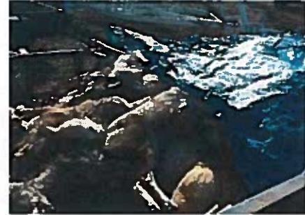
The results of a 2017 southern Illinois coyote killing contest.

In wildlife killing contests, participants vie for cash and prizes for killing a variety of species including coyotes, bobcats, foxes, squirrels, and even crows and other birds. Judging criteria may be based on the largest, smallest, or heaviest animals killed, or on a system of points assigned to each species. Raffle tickets may be sold for drawings to win rifles and other hunting equipment, and non-participants may even be able to bet on the outcome of the contest. Following the weighing or measuring of the animals and the awarding of the prizes, participants may celebrate with a banquet or party at a local bar or restaurant.