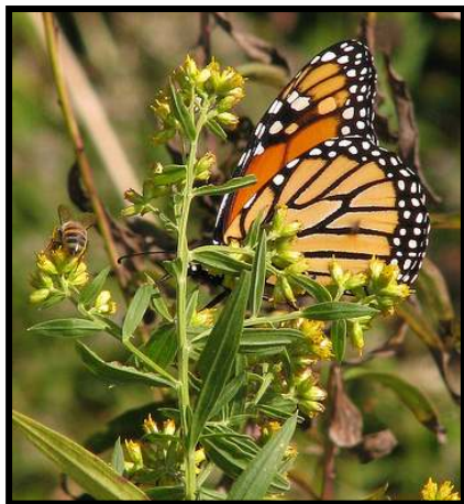
Monarch on goldenrod

Coreopsis ( Coreopsis spp.)- Coreopsis are prairie plants with a daisy-like appearance. They often come in hues of yellow, red and orange and are usually annual in nature. Like blazing stars, coreopsis are hardy, drought-tolerant plants. They often attract butterflies while in bloom, and later go to seed just in time for hungry migrants to indulge upon.