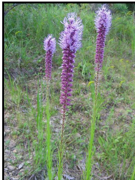
Blazing stars in western MD

Blazing stars typically grow best in sunny areas that have dry soil. Normally, plants can grow 2-4 feet in height, but some can reach heights up to 6 feet! Most blazing stars bloom in late summer, from early July through September. They produce tall spikes of purple flowers. Each flower spike contains multiple flowers which bloom from top to bottom. Some species, like the scaly blazing star ( Liatris squarrosa ) produce globular flower heads while most others have cylindrical spikes of flowers. The showy flowers are extremely attractive to pollinators including bees, butterflies and the occasional hummingbird. In addition, unusual species like the non-aggressive thread-waisted wasp also enjoy the nectar. Just about all of the species of blazing star in Maryland have grass-like leaves and all arise from a bulb-like structure known as a corm.