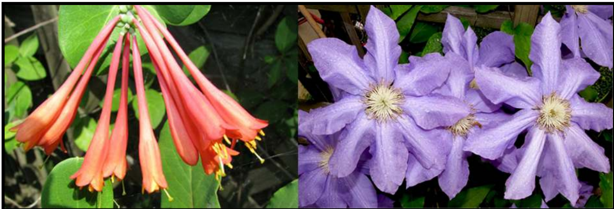
Trumpet honeysuckle (left) and clematis (right) are easy to grow vines that work well in containers