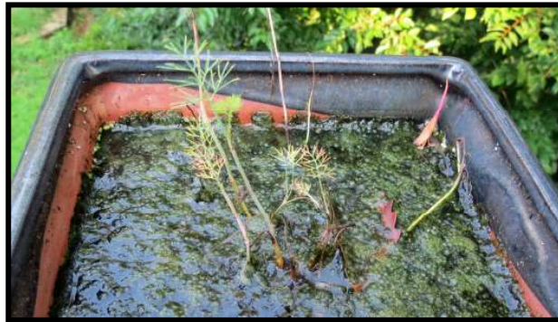
A container with poor drainage can cause problems for plants. This container has developed an algae mat.

Some plants that work well in containers include: