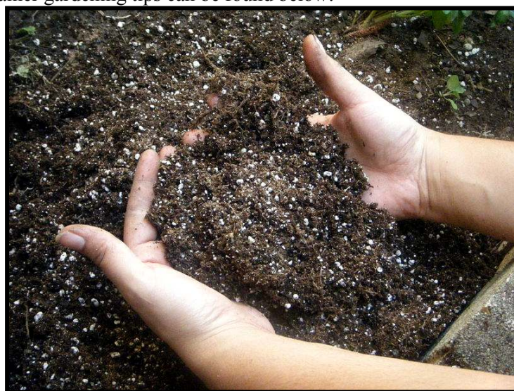
Quality potting soil with perlite (white spots) by M Tullottes

Once you have your plants and pots, then it is time to think about soil. Most potting soil has components like sphagnum peat moss, vermiculite and/or perlite. A quality potting soil has 10-15% perlite. Perlite helps separate peat moss fibers, so the soil is more porous. Vermiculite works in a similar manner, but it tends to hold more moisture. If starting seeds, then a vermiculite-based potting soil is ideal. For most plants, an all purpose potting mix will suffice. However, some potting soils are designed for acid-loving plants or for cacti and succulent species. Additional container gardening tips can be found below: