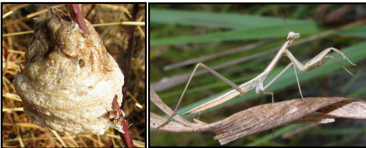
An egg case from a European mantis (left) and a young mantid (right) by Kerry Wixted

While females are notorious for consuming the males, only 30% of males lose their heads after (or during) mating. In the fall, females lay 100-400 eggs in foamy egg cases known as oothecae which later harden into a more papery texture. These oothecae can be found attached to branches, houses and grasses in the backyard. In May, young mantids break out of the egg casing and will begin hunting prey (which sometimes includes their slower siblings!). The tiny mantids will go through several molts until reaching their adult stage. Overall, most praying mantises live from 6 months to a year.