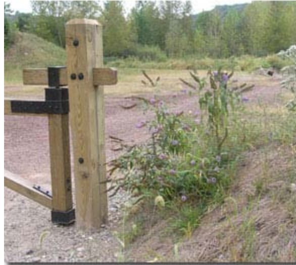
Butterfly bush invading an area in Pennsylvania.

From its name to its flowers, butterfly bush seems like an appealing plant to add to your backyard wildlife habitat. However enticing, butterfly bush ( Buddleja species) has a dark secret: it's highly invasive. Invasive species are non-native species that cause problems. Butterfly bush can easily spread from plantings to new areas and can compete with native species for resources. While some species of butterflies do enjoy butterfly bush, no native caterpillars host on this plant. Without host plants, butterflies cannot reproduce. In addition, fewer native pollinators will use butterfly bush compared to a similar native species. Therefore, butterfly bush takes up valuable space which could be occupied by species which provide all the needs for wildlife.