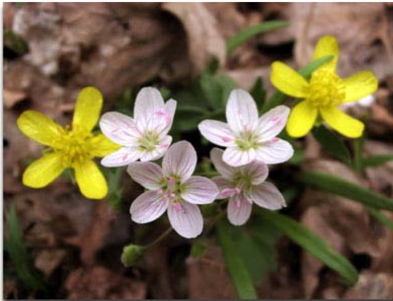
Spring is just around the corner! Look for Spring beauties and buttercups blooming in rich woods near you!

Welcome to the Spring issue of Habi-Chat! If you have been visiting the Wild Acres website regularly, then you might have noticed some big changes the past few months. I am excited to say that we have added a bunch of new pages on insects and their benefits as well as updated all of the old pages. In addition, several of the pages now have links to PDFs, so you can easily print the material at home as well as print out quick reference wildlife ID guides. Keep a lookout in the coming months for a new section to our website: Greening Your Landscape as well as new articles on making your backyard the best it can be for wildlife. If there is a particular topic that you would like to see on our site, then please don't hesitate to contact me to let me know! My information can be found at the bottom of this newsletter. Happy Habitats!