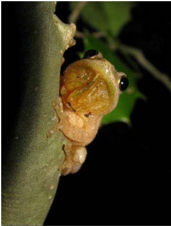
Male spring peeper. Note the vocal sac under his chin.

Spring peepers have a dynamic color which can change throughout the day to help them blend into their environment. They range from a light beige to a deep brown color and can be easily identified by looking for an X-mark on their back. Spring peepers have long, sticky toes with well developed toe pads to help them climb multiple surfaces. This is a characteristic seen in most species of treefrogs. Since males are responsible for calling out to the females, they have a dark brown vocal sac under their chin. When they call, the vocal sac fills with air, and when it deflates, the vocal sac looks like wrinkled skin. Females have a uniformly colored chin and throat.