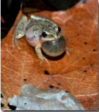
A calling spring peeper.

While noticeably quieter in the non-breeding season, spring peepers still remain active. Many of the adults move away from their breeding areas and take up residence in habitats that range from moist woods to old fields. During the winter, spring peepers hibernate in small burrows or under leaf litter. Interestingly enough, spring peepers like many other frogs can withstand freezing body fluids for up to two weeks! On average, spring peepers live up to 3 years in the wild.