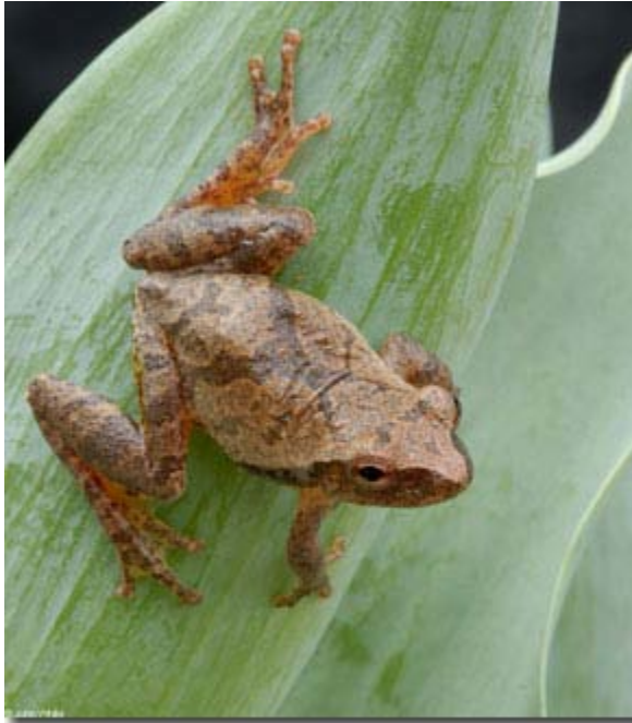
Spring peepers vary in color, but they can be ID'ed by the X-mark on their backs.

Forget the groundhogs! To me, the ultimate sign of spring is the unmistakable call of the spring peeper. Spring peepers are tiny treefrogs found throughout Maryland and much of the eastern United States. These little guys only reach lengths up to 1 inch long, and many times, their high-pitched “peep” call is heard more often than they are seen.