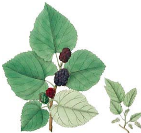
Native Plant Profile.....Red Mulberry ( Morus rubra L.)