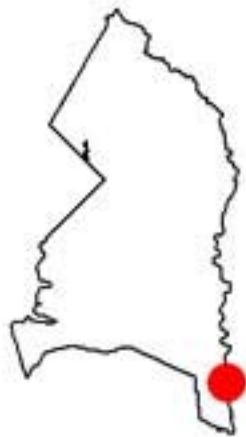
Location of Aquasco Farms CWMA within Prince George's County