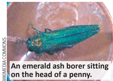
An emerald ash borer sitting on the head of a penny.

The vast forests of green and pumpkin ash along the Marshyhope River are threatened by the tiny yet very destructive emerald ash borer (EAB). EAB is an invasive beetle from Asia that is decimating almost all ash that it encounters. Millions of ash in the central and northeastern United States have succumbed to this beetle and some ecologists consider it a more serious threat than the ubiquitous, non-native gypsy moth. Emerald ash borer larvae tunnel through the tissues responsible for food and water distribution within a tree, causing the ash to starve to death. While EAB has not been found on the Eastern Shore as of 2012, it is only a matter of time before it colonizes along the Marshyhope.