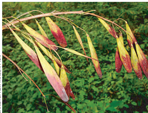
CHRISTOPHER TRACEY, PNHP

For more information: http://dnr.maryland.gov/wildlife/Pages/publiclands/eastern/lecompte.aspx