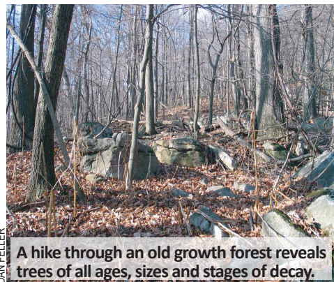
A hike through an old growth forest reveals trees of all ages, sizes and stages of decay.

Special Note: Savage River State Forest is used seasonally by hunters.