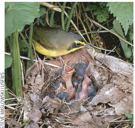
Kentucky warblers nest among dense vegetation on the ground.

The diversity and size of habitats within Parkers Creek make it a haven for nesting birds, particularly Forest Interior Dwelling Species (FIDS). The National Audubon Society recently designated Parkers Creek as an Important Bird Area due to the 19 species of FIDS found regularly breeding there. Of particular interest are the wood thrush and Kentucky warbler. These migratory songbirds have significant breeding populations here but are in decline throughout much of their breeding range in the U.S. Increased forest fragmentation has made their nests more vulnerable to parasitism by female brown-headed cowbirds. These unusual birds lay their eggs in other birds' nests. For smaller songbirds, such as warblers and wrens, the adult ends up eventually feeding a chick that is nearly twice its size, while its own chicks starve!