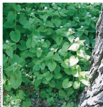
Garlic mustard quickly crowds out native vegetation.

One of the hillsides adjacent to Monroe Run supports three species of woodland salamanders (plethodontids). This assemblage is unusual as two of the species – the eastern red-backed and the valley and ridge – rarely occur together. Eastern red-backed salamanders have a distinctive red stripe along the back and tail. Some lack most or all of the red pigmentation and are sometimes known as "leadbacks." Strongly resembling the leadback, the valley and ridge salamanders are deep brown in color, with scattered white spots and brassy flecks. The slimy salamander is the third woodland species in this area. This well-named plethodontid has tail glands that secrete a sticky substance when the animal is handled roughly.