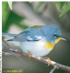
GEORGE JETT © 2006

Among these colorful birds is the northern parula, a small warbler that nests in tree mosses. Pedal or hike the Indian Head Rail Trail to view these birds in spring and summer.