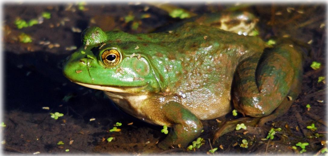
American Bullfrog

American Bullfrogs, which are native to the Mid-Atlantic, were introduced into the Western part of the U.S. in the early 1900s. Because Bullfrogs are large and will eat anything they can fit in their mouths, Bullfrogs were quickly able to outcompete many native western frogs. In addition, Bullfrogs may be carriers of chytrid fungus and Ranavirus, diseases which spreads to native frogs that have never been exposed to the pathogens. As a result of Bullfrog competition and pathogens, many native amphibian species in the western U.S. are now threatened or endangered.