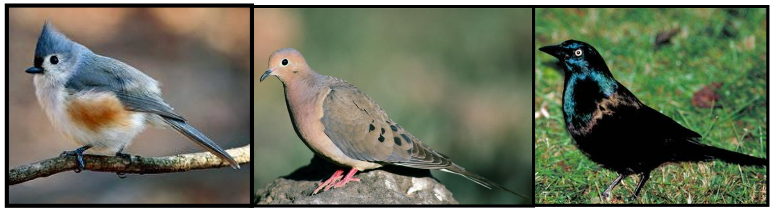
Tufted Titmouse by: Sanjib Bhattacharyya