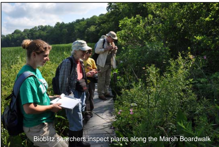
Bioblitz searchers inspect plants along the Marsh Boardwalk