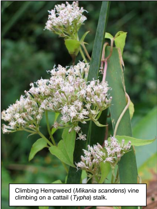
Climbing Hempweed ( Mikania scandens ) vine climbing on a cattail ( Typha ) stalk.