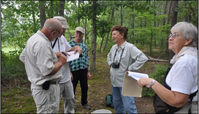
Volunteer bird banders at the mist nets.