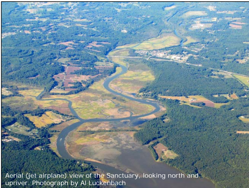
Aerial (jet airplane) view of the Sanctuary, looking north and upriver.

A Bioblitz is a brief, intensive survey of plants, animals and other organisms that is conducted in a coordinated way by scientists and amateurs working together in a well-defined study area. Bioblitzes are educational and fun, and can provide us with a greater understanding about local biological diversity. The new knowledge gained about the occurrence, distribution and relative abundance of plants and animals can be critical for protecting rare or unusual species, and for developing effective habitat management plans. Ecologists, resource managers and students can use this information on the presence or absence of species in an area to initiate new studies or management plans. A Bioblitz can also attract scientists to a site which could lead to other projects in the future. Just as important, Bioblitzes are an excellent way to involve the public in an event that broadens their understanding of biological diversity, and gives them hands-on experience identifying organisms and recognizing the habitats where organisms live. Bioblitzes help citizens become citizen scientists.