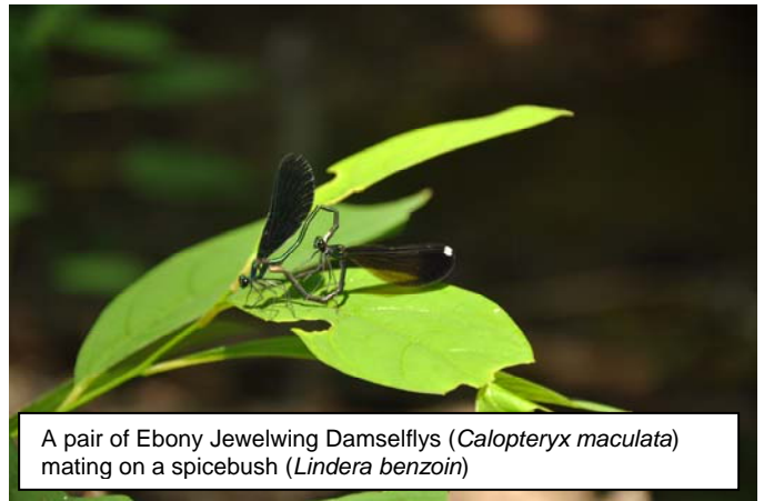
A pair of Ebony Jewelwing Damselfly ( Calopteryx maculata ) mating on a spicebush ( Lindera benzoin )