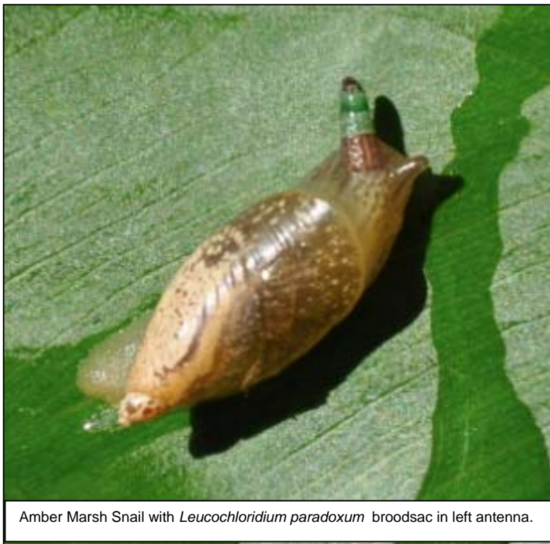
Amber Marsh Snail with Leucochloridium paradoxum broodsac in left antenna.