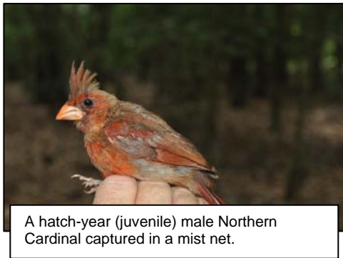
A hatch-year (juvenile) male Northern Cardinal captured in a mist net.