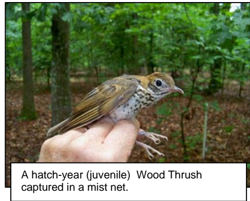
A hatch-year (juvenile) Wood Thrush captured in a mist net.