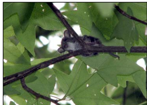
Clockwise from top, White-footed Mouse; Harry Coulombe releasing a Virginia Opossum; White-footed Mouse up a tree; Virginia Opossum in trap.