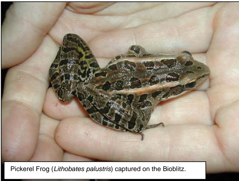
Pickerel Frog ( Lithobates palustris ) captured on the Bioblitz.