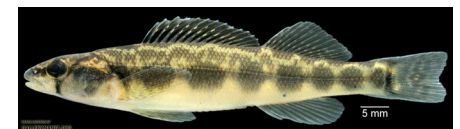
Stripeback Darter Percina notogramma Max size: 70 mm