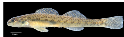
Johnny Darter Etheostoma nigrum Max size: 40 mm