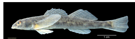
Glassy Darter Etheostoma vitreum Max size: 55 mm