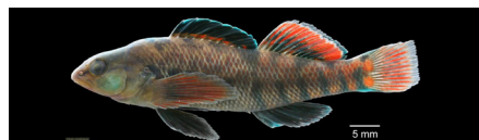
Rainbow Darter Etheostoma caeruleum Max size: 50 mm