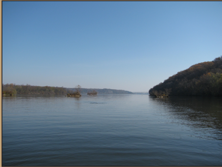
Maryland darters may swim undetected on the bottom of the large Susquehanna River between Conowingo Dam and Havre de Grace, Maryland. Biologists from MDNR, Frostburg State University, and Marshall University will survey the river for this rare species in 2009 and 2010.

The search is on for the Maryland darter, a federally-endangered fish that has not been seen for over 20 years and is feared extinct. Biologists from Frostburg State University, Marshall University in West Virginia, and the Maryland Department of Natural Resources (MDNR) have teamed up to determine once and for all if this rare species still swims in Maryland waters. In 2009 and 2010, they will be surveying the waters of the Susquehanna River between Conowingo Dam and Havre de Grace and three Harford County streams for this exceedingly rare species.