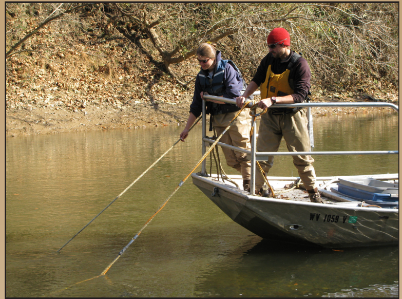
Biologists pull an electrified trawl at the mouth of Deer Creek in November 2009. This trawl has been designed to catch bottom-dwelling fishes and will be used to search for the rare Maryland darter.

The Maryland darter is one the rarest fishes in the world and is only known from Swan, Gasheys, and Deer creeks in Harford County, Maryland. It is a small bottom-dwelling species related to yellow perch and walleye. Unlike these other fishes, adult Maryland darters are small; reaching a maximum size of just under 3 inches on a diet comprised of small insects and snails. It was last seen in 1988 in Deer Creek. For more information on Maryland darters and why it is an important species visit http://www.dnr.state.md.us/wildlife/mddarter.asp