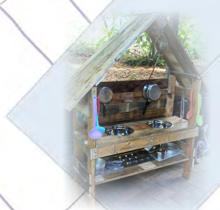
B. Play Kitchen