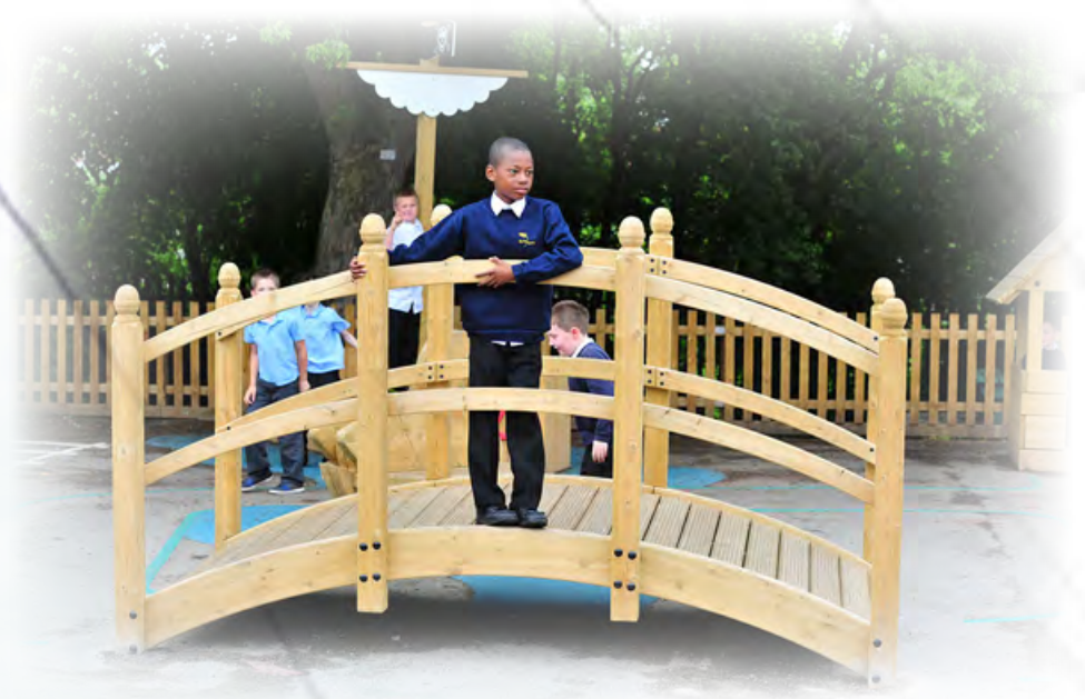
K. Arched Bridge