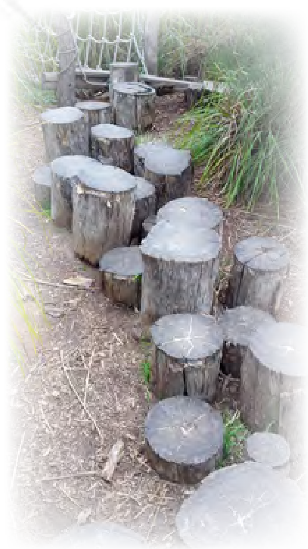
F. Stump Jump