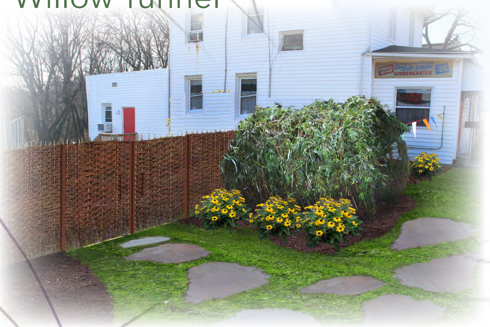
L. Willow Tunnel