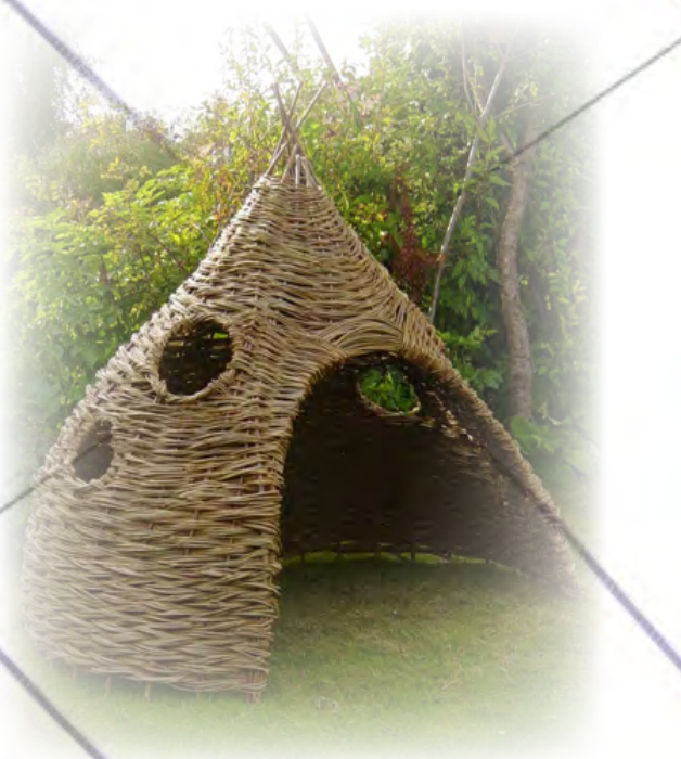
A. Willow Hut