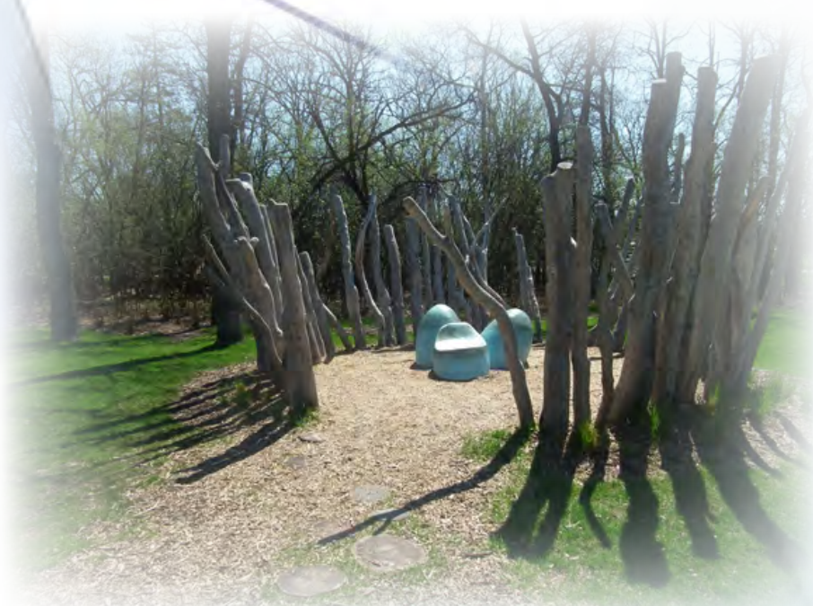
I. Reading/ Gathering