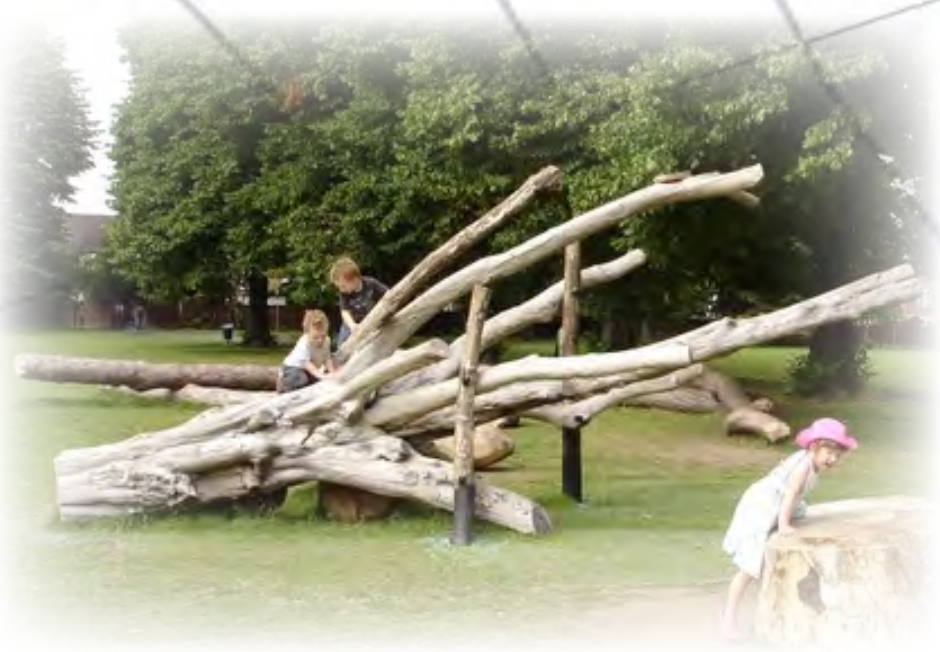
G. Log Climb