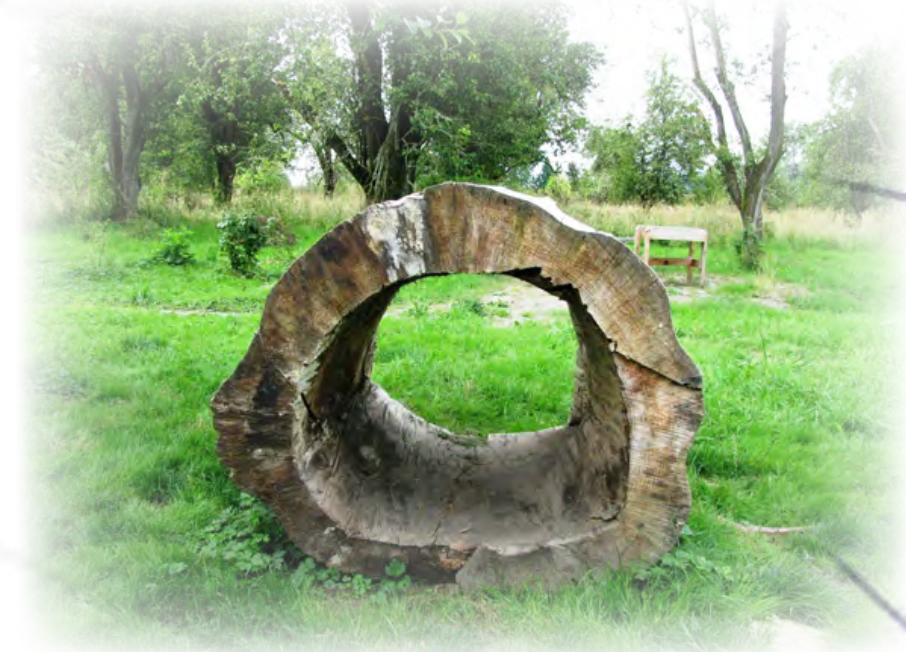
C. Hollow Log