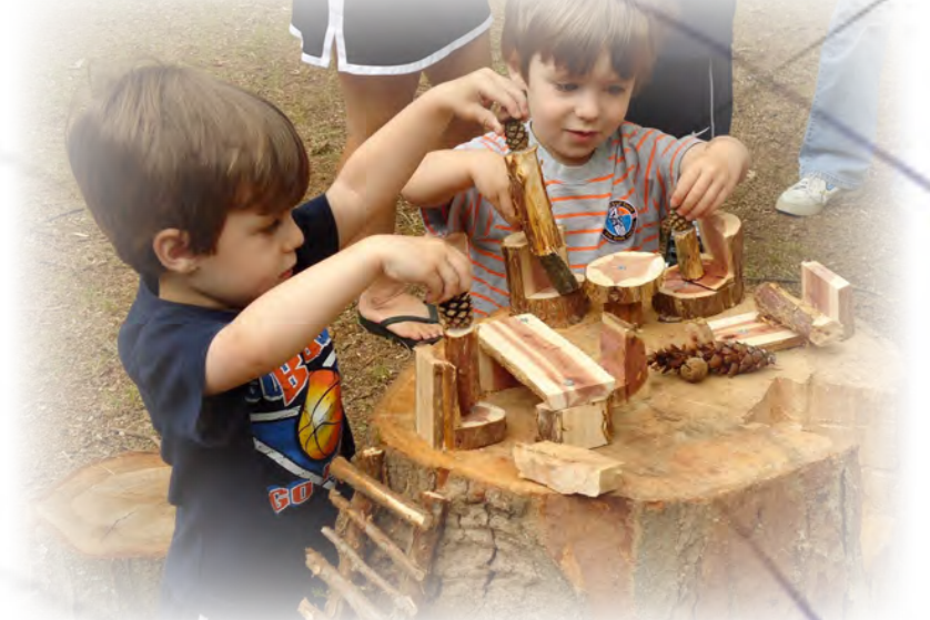
D. Small Object Manipulation