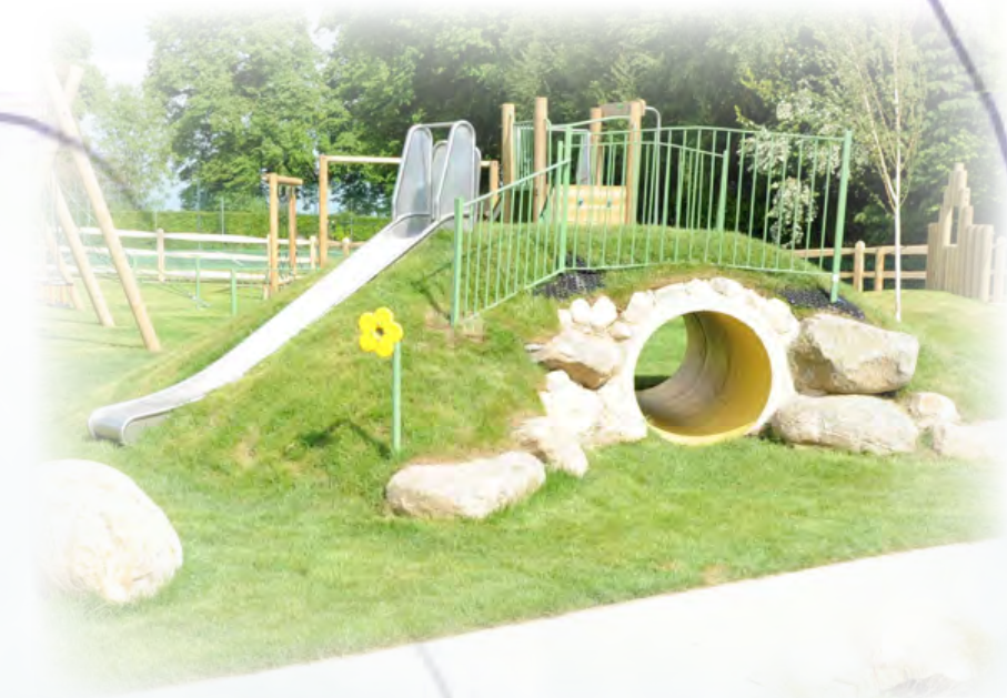
J. Climb and Crawl