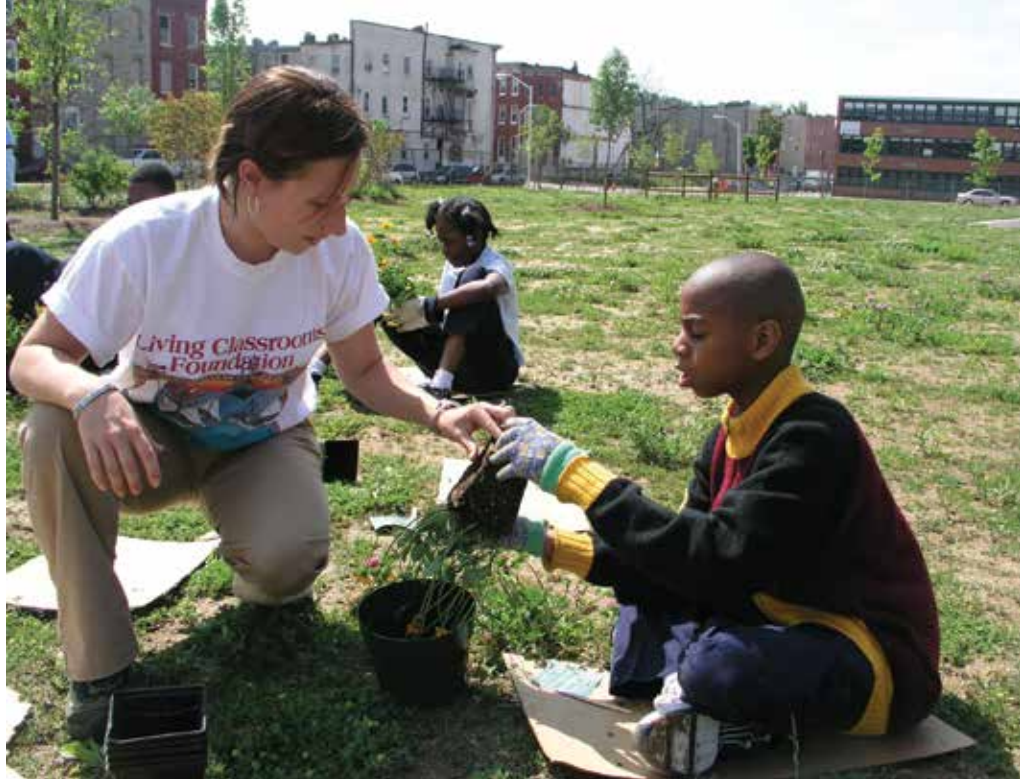
Living Classrooms Foundation, a recipient of a 2021 Keep Maryland Beautiful Grant.

Sixty-five Clean Up & Green Up Maryland Grant awards totaling $250,000. This grant was established in 2017 to help community groups and nonprofit organizations statewide with neighborhood beautification activities that include litter removal, greening activities, community education, and citizen stewardship statewide.