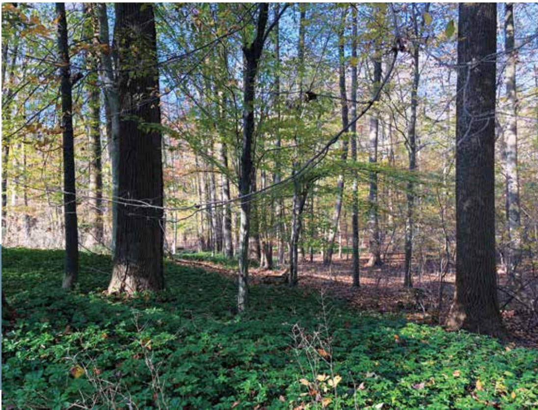
View of forested land in Harford County protected by an easement from Foxridge Drive, LLC to MET and Harford Land Trust.