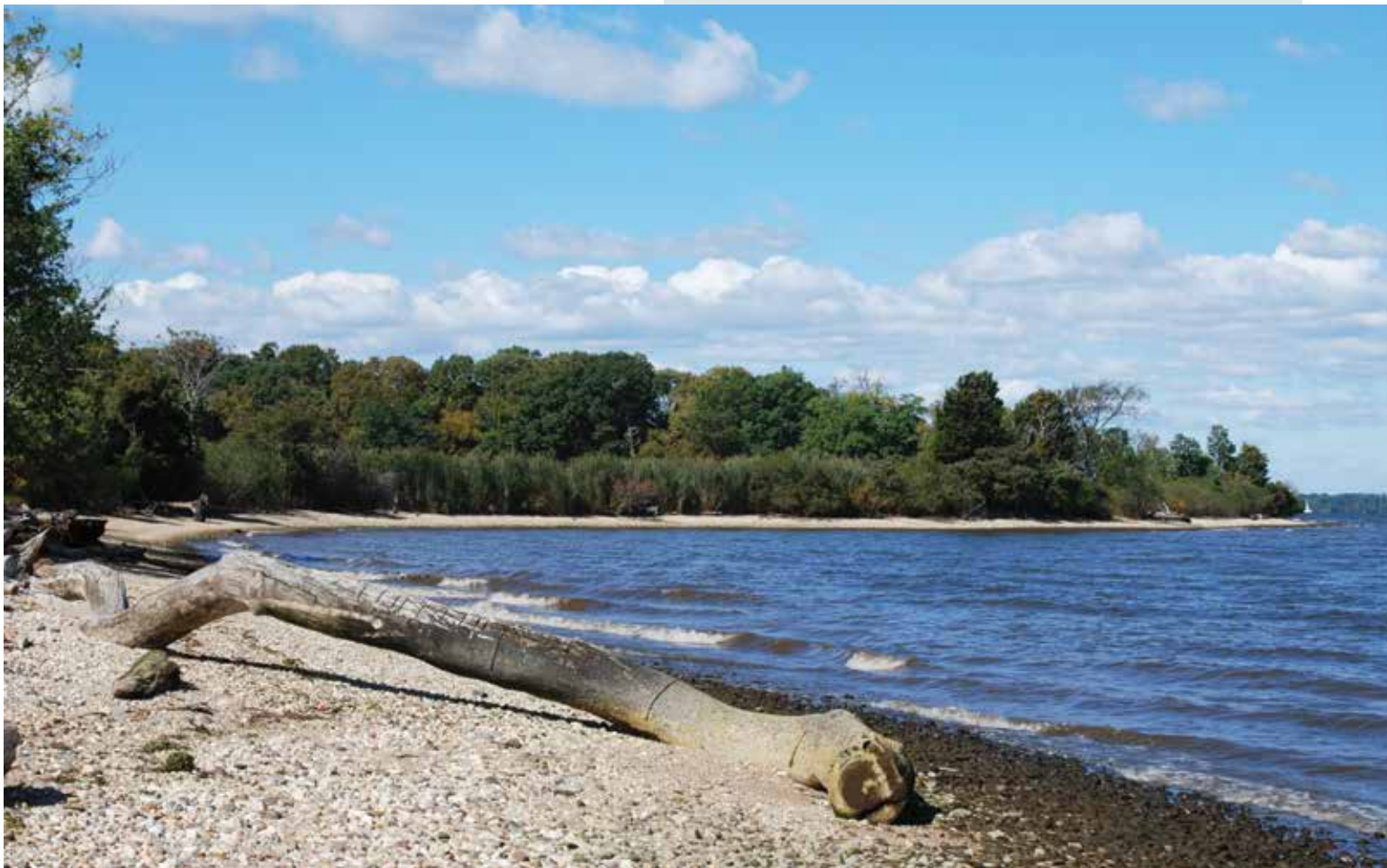
Above: View of property along the Chesapeake Bay in Kent County protected by an easement from Shell Point Farm & Forest, LLC to MET and Eastern Shore Land Conservancy.

program. The farms are located within the priority protection area for the Army's Aberdeen Proving Grounds and are rich in agricultural and natural resources.