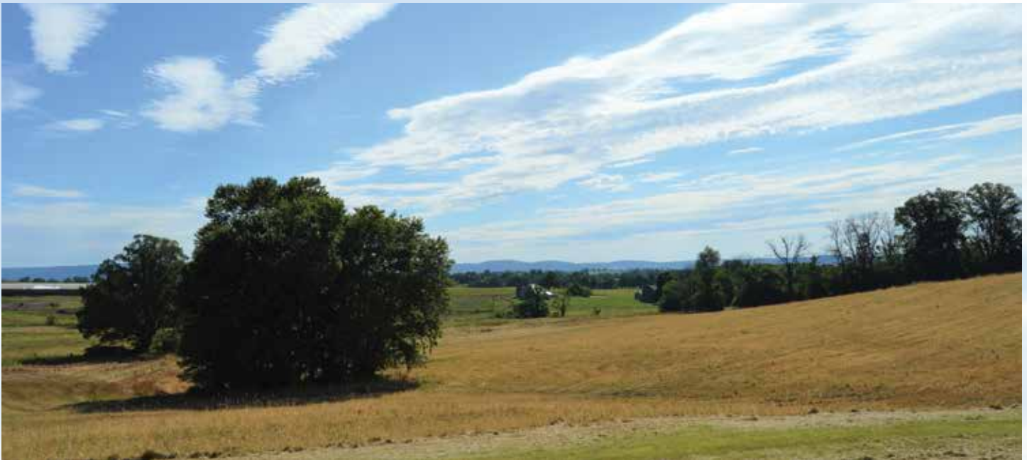
View of the Brandenburg property protected by an easement from American Battlefield Trust to MET and Frederick County.

It's been quite a year! Despite what 2020 threw at us, Maryland Environmental Trust (MET) continued our work with landowners and conservation partners to protect an additional 1,379 acres. With limited staffing and working mostly from home, MET successfully negotiated the completion of seven new conservation easements on farmland, forests, and wetlands around the state. The new easements protected land in Frederick, Kent, Washington, Somerset, and Harford Counties. Six of the new easements are co-held with a land trust or county government partner. MET also completed two easement amendment projects that strengthened the conservation provisions of existing MET easements on 213 acres. Each conservation project represents a family committed to conservation. It was a pleasure working with these landowners during 2020 to permanently protect critical natural resources that will endure for future generations to enjoy.