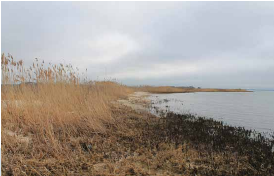
Left and below: Views of marshland on the Leese property in Somerset County protected by an easement granted to MET and Lower Shore Land Trust.

through a grant secured by Ducks Unlimited from the federal North American Wetland Conservation Act (NAWCA) to protect habitat for the American black duck. The black duck has been in precipitous decline over the past few decades leading to its designation as a species of conservation concern. The easement permanently protects approximately 36 acres of agricultural land, 330 acres of forest, 700 acres of emergent tidal wetlands, and thousands of linear feet of shoreline along Marumsco Creek and Pocomoke Sound.