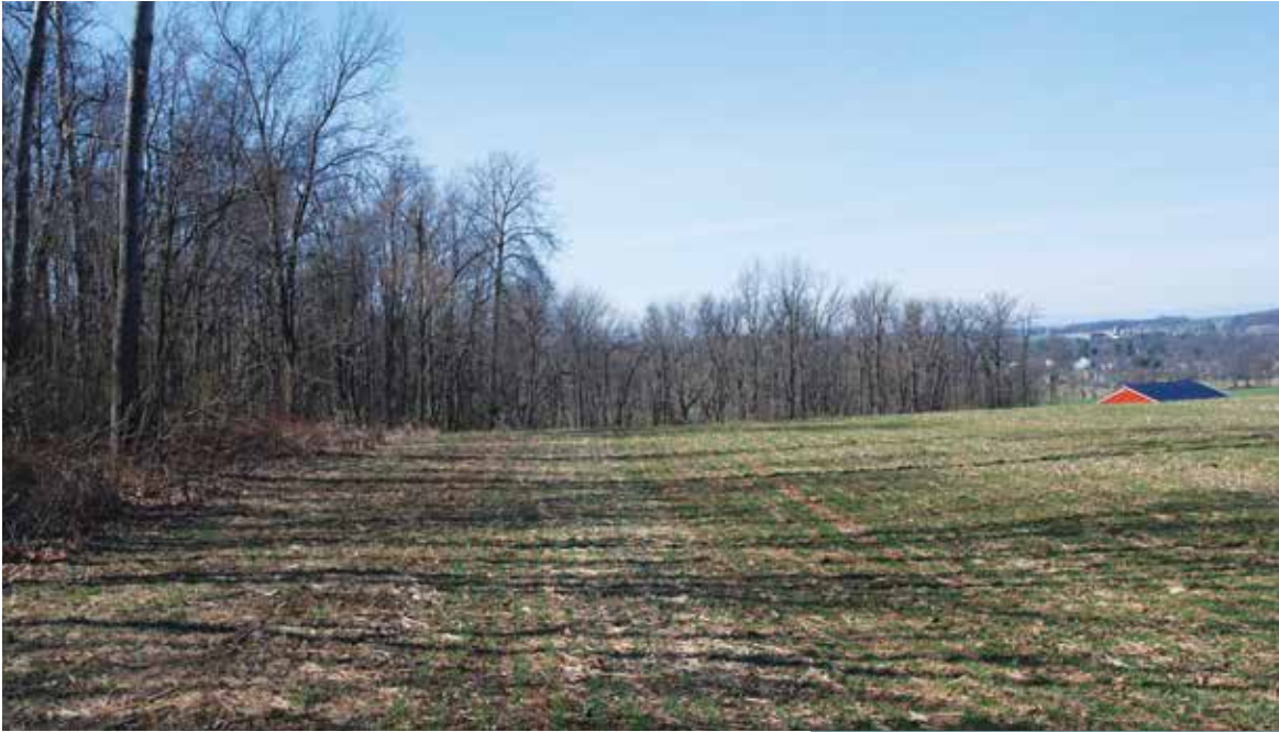
Above: View of forested land in Washington County conserved by an easement to MET from Blue Mountain Farm, LLC.

freshwater biodiversity conservation. The property is also near South Mountain State Park and several thousand acres of protected public and private land.