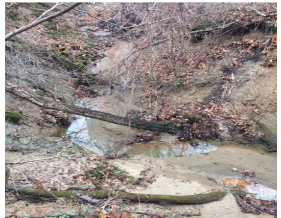
Prior to restoration work, Flat Creek was little more than a trickle due to heavy erosion and sediment filling in the creek bed (2018).

It has been about three years since the restoration project was complete and already the stormwater flows have slowed, and native vegetation and wildlife is flourishing. (story continues on page 3)