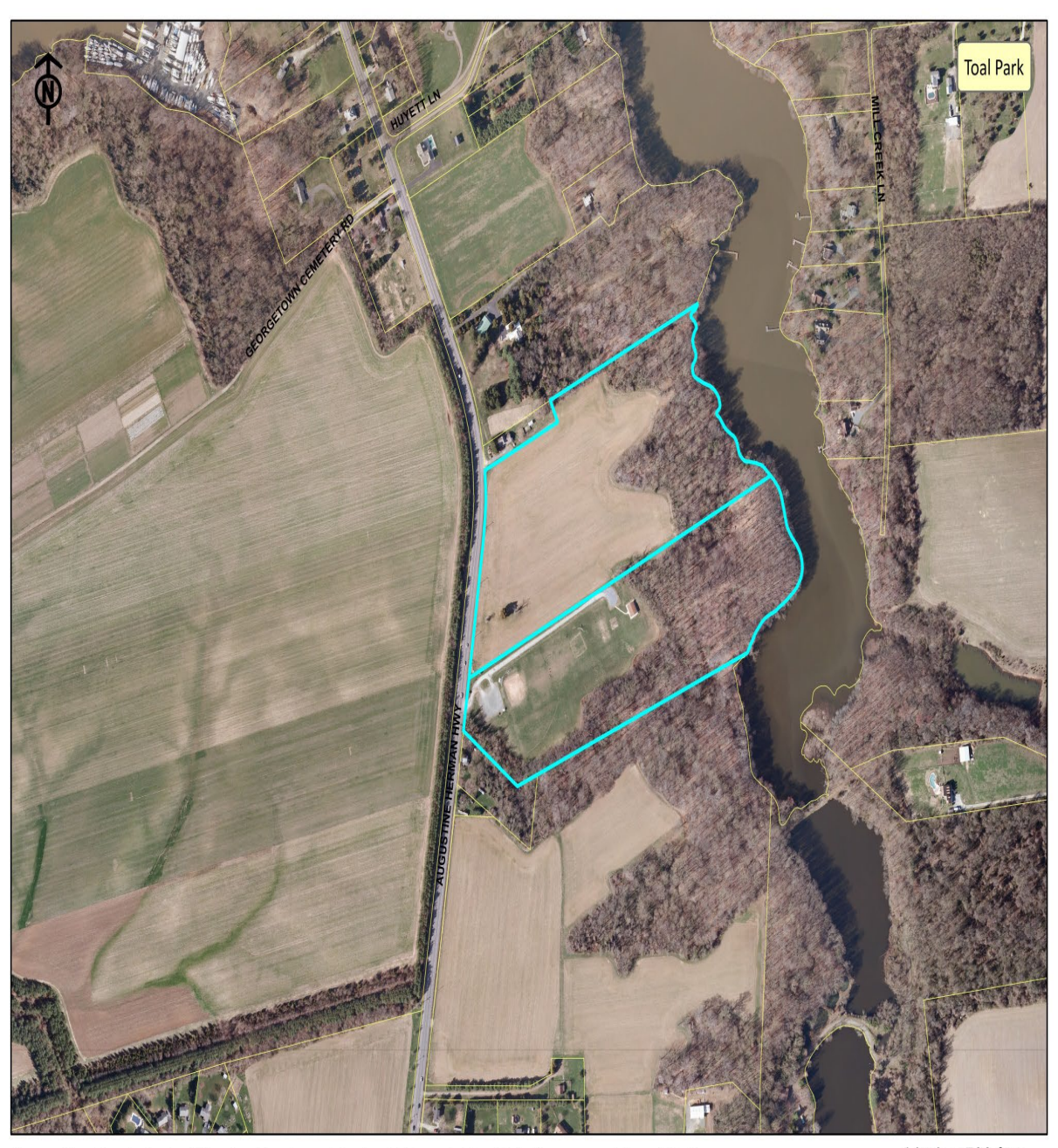
Source: Kent County Dept. of Planning, Housing and Zoning. MdProperty View 2011. Map prepared August 2013.