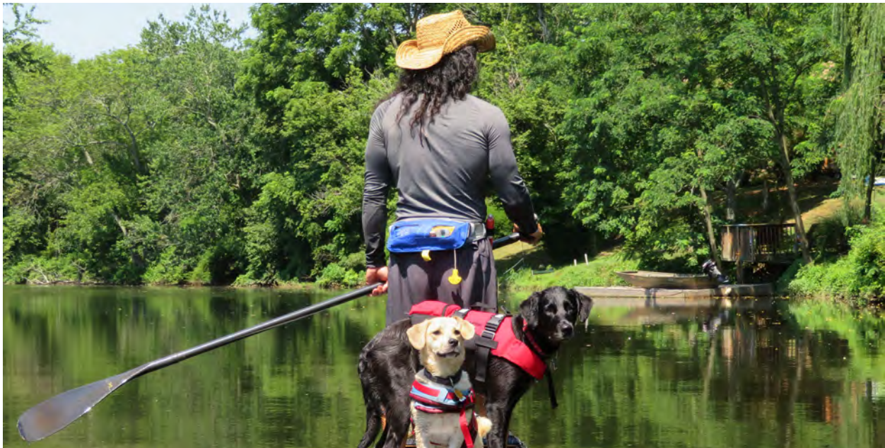
Paddleboarding with Dogs by Norma Broadwater