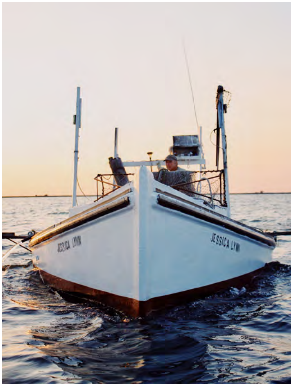
Scraping Bottom

The significance of outdoor recreation in Maryland cannot be summarized in a single sentence. From a leisurely walk in a neighborhood park to fishing on the Chesapeake Bay or camping in the Appalachian Mountains, there are endless outdoor opportunities in Maryland. The benefits of outdoor recreation and land conservation are far-reaching and have positive impacts on public health, the environment, and the economy. National, state, and local parks, forests, trails, beaches, and open spaces are foundational infrastructure that support the variety and quality of outdoor recreation experiences that contribute to Marylanders' high quality of life and make the state attractive to visitors. In Maryland, outdoor recreation generally includes activities that are dependent on the natural landscape and outdoor environments, such as boating, fishing, hunting, hiking, and camping.