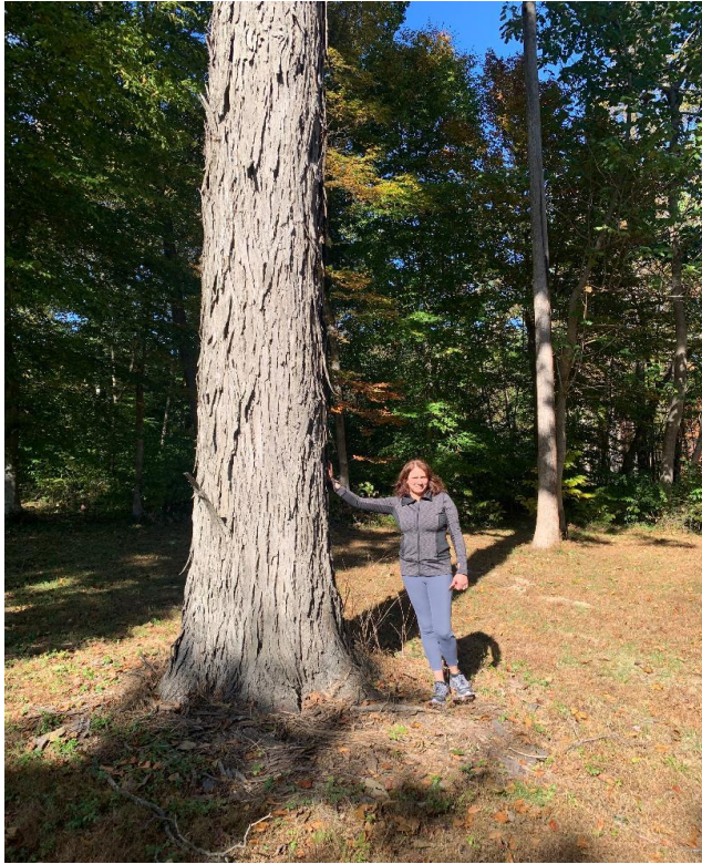
Shagbark Hickory, Talbot County Champion