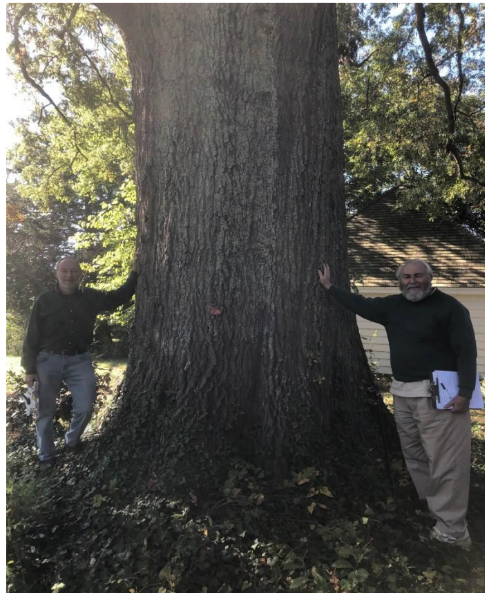
Willow oak, St. Mary's County