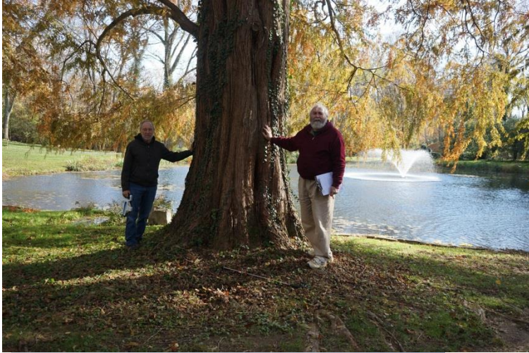
Dawn redwood, Baltimore County,