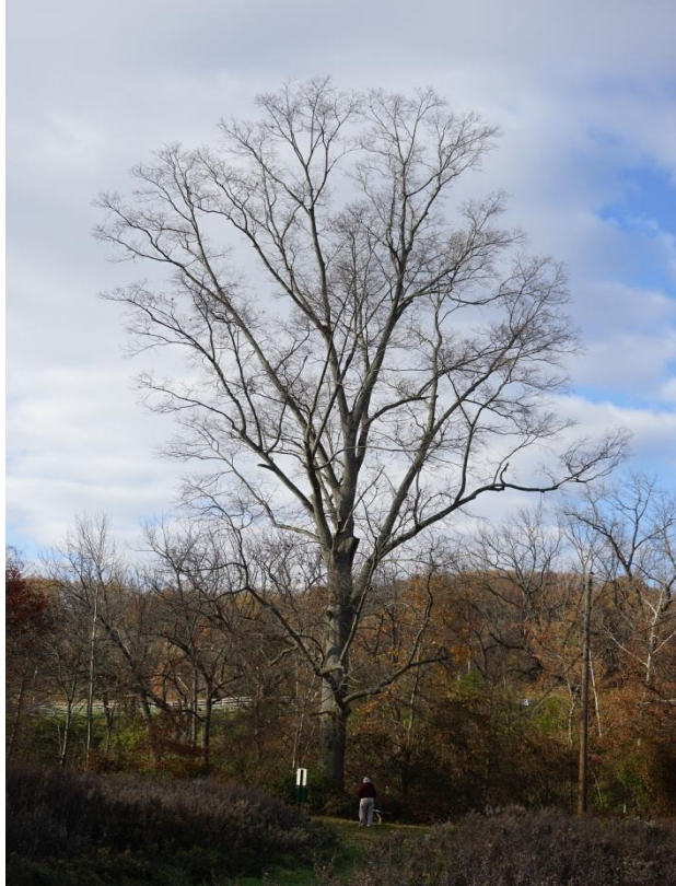
Bitternut Hickory, Baltimore County Champion