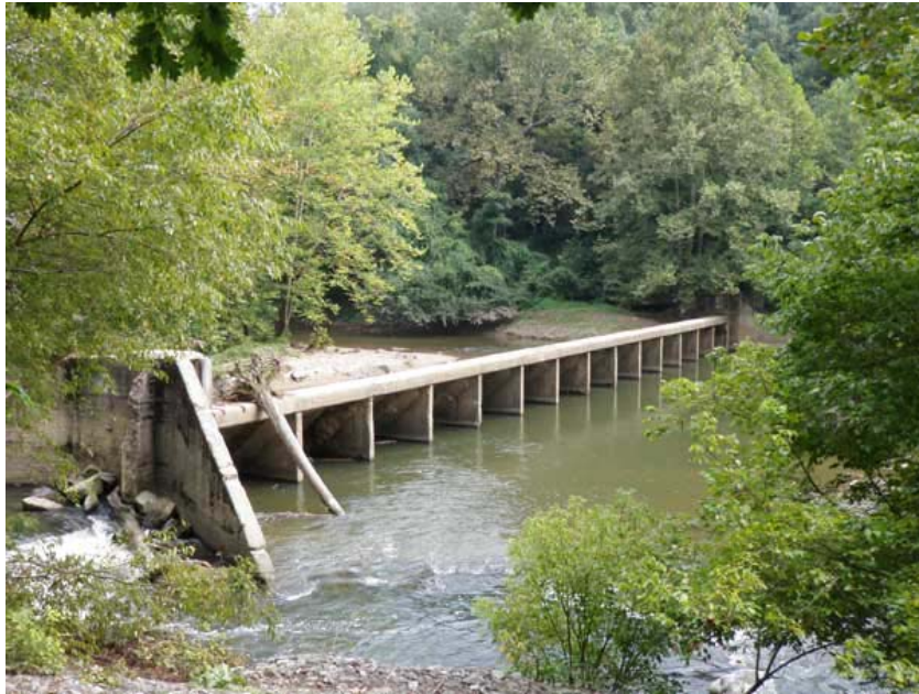
Union Dam – Pre Removal