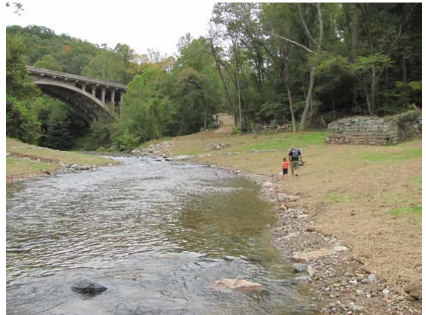
Union Dam – Post Removal