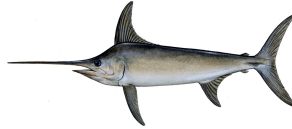
Illustration by Diane Rome Peebles

Swordfish MUST have a catch card completed AND be tagged BEFORE being legally removed from the vessel. Catch cards are available from reporting stations at most marinas, tackle shops and online.