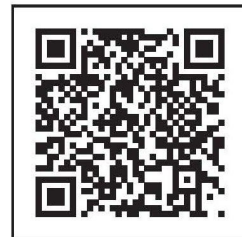
MD DNR - Catch Card and Tagging Program Learn more here

Complete both the card AND the receipt on the side. Retain the receipt and deposit the completed catch card into the Bluefin Tuna, Billfish and Shark kiosk located on the outside of the Natural Resources Police office in the Colonel Jack Taylor Boat House, 12917 Harbor Road, Ocean City Maryland.