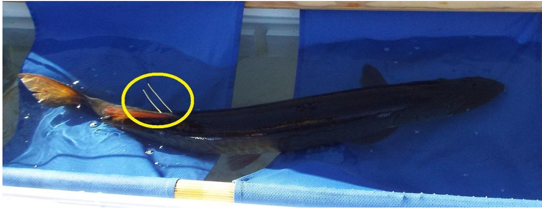
Image 1. Two yellow anchor tags are used to identify transmitter tagged Muskellunge in the upper Potomac

Throughout 2020 and 2021, a postcard survey was distributed to individuals actively fishing the freshwater Potomac River to determine a participation rate by anglers. A total of 70 postcards with prepaid postage were handed out and individuals who submitted these were placed into a prize drawing. Results indicate that 79% of Potomac River anglers DO NOT participate in surveys. This information will help in adjusting Muskellunge tag return data.