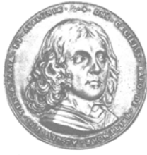
Cecilius Calvert First Proprietor of Maryland