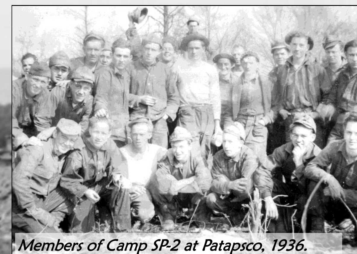
Members of Camp SP-2 at Patapsco, 1936.