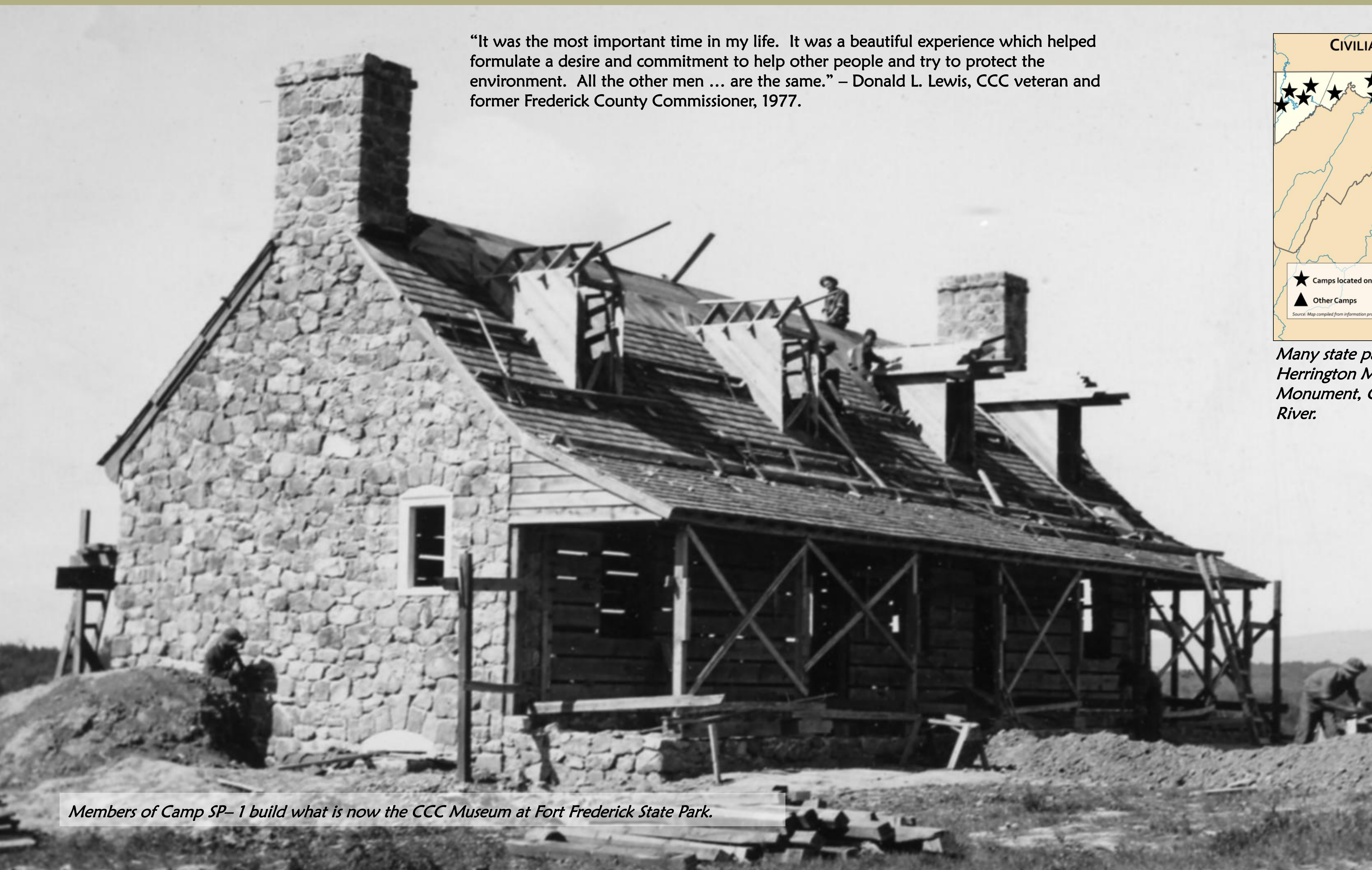
Members of Camp SP-1 build what is now the CCC Museum at Fort Frederick State Park.