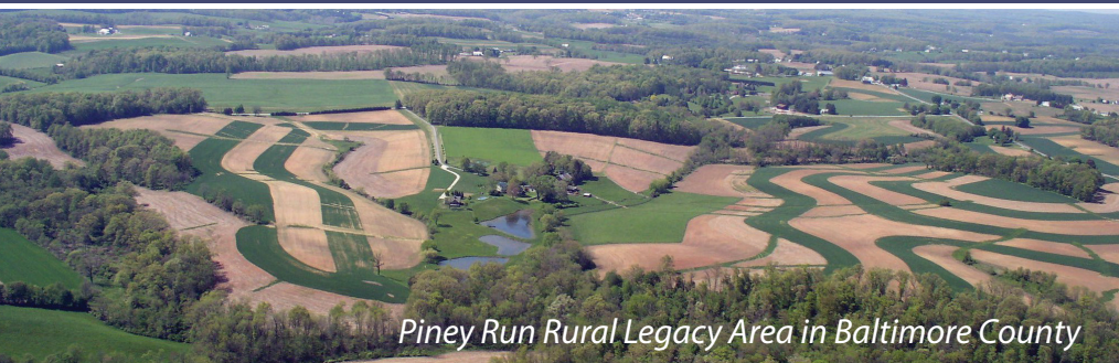
Piney Run Rural Legacy Area in Baltimore County

Provided $18.8 million in Rural Legacy Program grant funds to protect more than 5,900 acres .