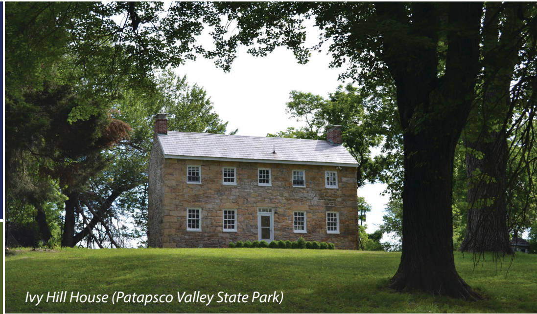
Ivy Hill House (Patapsco Valley State Park)