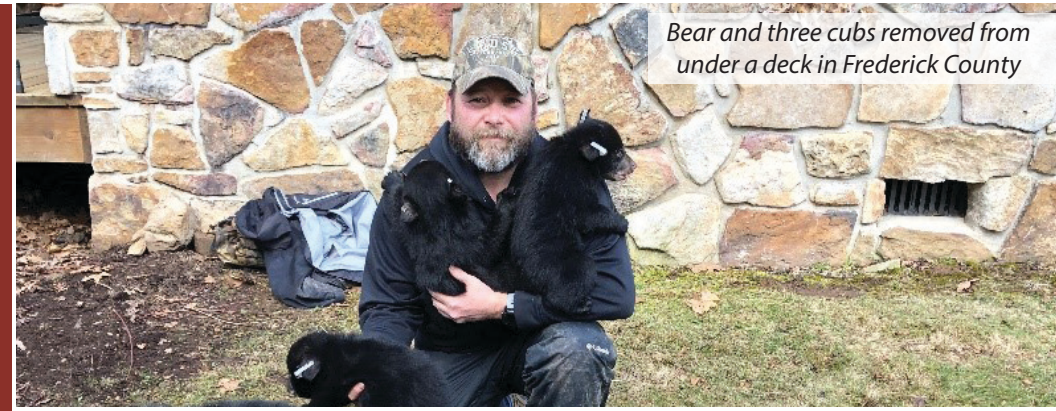
Bear and three cubs removed from under a deck in Frederick County

In 2020, Wildlife and Heritage Service staff tagged a total of 20 cubs from six sows in Garrett, Washington, and Frederick counties. The average cub production this year was 3.3 cubs per sow. Since 1986, when the survey began, 495 cubs have been born to 168 sows for a long-term average of 2.9 cubs per sow. A highlight of the den season was our second recorded five-cub litter from a newly radioed sow in Garrett County.