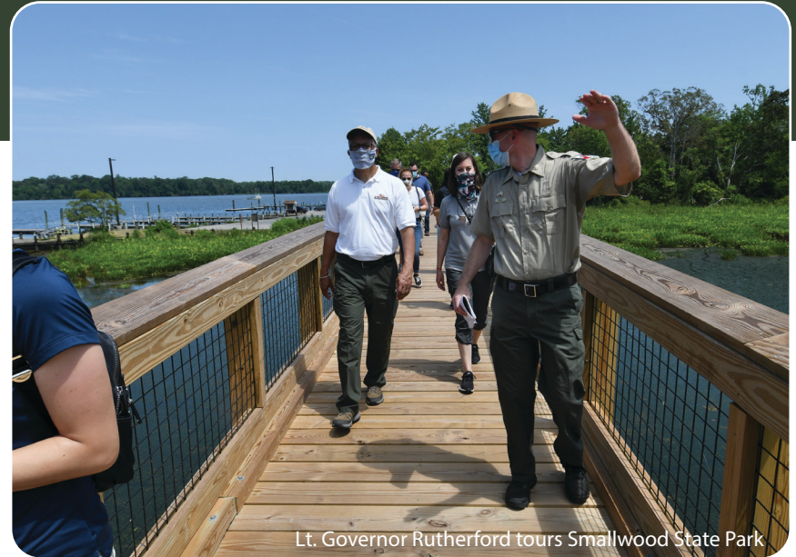
Lt. Governor Rutherford tours Smallwood State Park