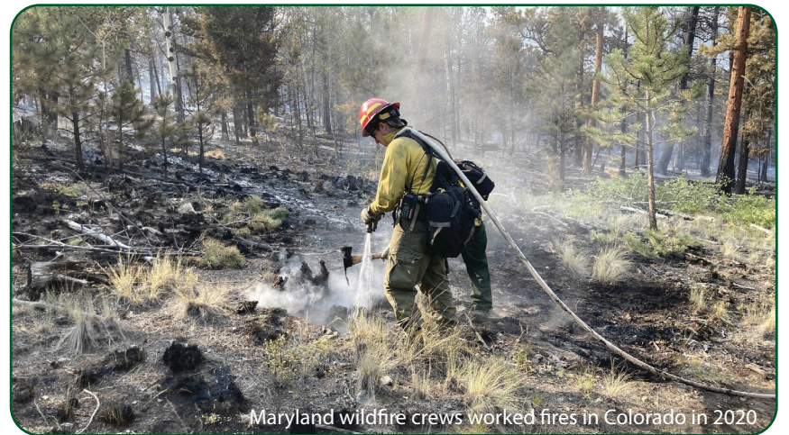
Maryland wildfire crews worked fires in Colorado in 2020

The facilities and services of the Maryland Department of Natural Resources are available to all without regard to race, color, religion, sex, sexual orientation, age, national origin, or physical or mental disability. This document is available in alternative format upon request.